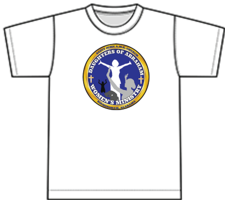
Tee Shirt (A)

Would you like to become a member of the Daughters of Abraham? Would you like to be contacted by a member to provide information about the Women Ministry? We meet every third Saturday of the Month at 10:00 a.m. [ ] YES OR [ ] NO