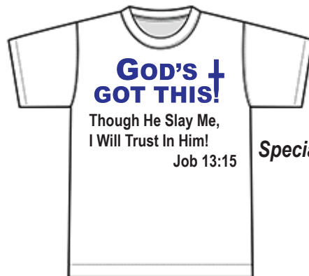
Tee Shirt (B) Bling Bling Tee